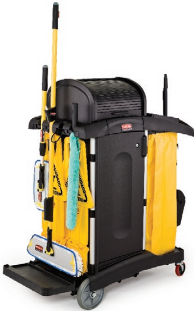
Rubbermaid FLOW™ is designed to work in conjunction with other Rubbermaid floor care equipment for a smart, safe, time-saving system.

Save time and money with the new Rubbermaid FLOW™ Floor Finishing System. This high-capacity, highly portable complete finishing system helps reduce labor costs and improve worker well-being.